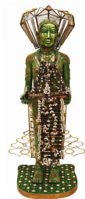
SIZE : 60H X 22D X 36W INCHES

Discarded Wooden Sculpture Discarded Chair Seat Jacquard Weaving Discards Metal Mesh Scrap Brass Jewellery Scrap Metal Scrap Contemporary Lac and Mirror Work Vintage Cowrie Shell Trimmings