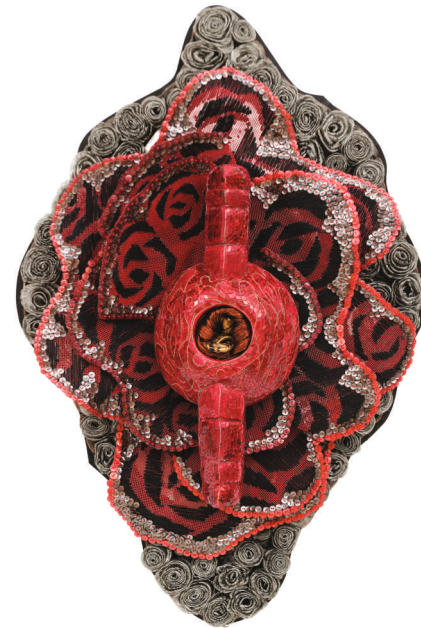
SIZE : 38H X 25W X 9D INCHES

Scrap Metal Mesh Embroidery Thread Buttons Antique Wooden Buttermilk Churner Mirror